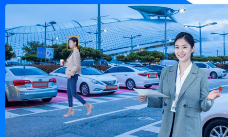
4 Selective personal information de-identification