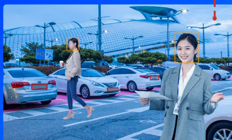
3 Personal information extraction